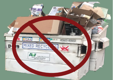
Overloading your containers can result in service delays and fines.