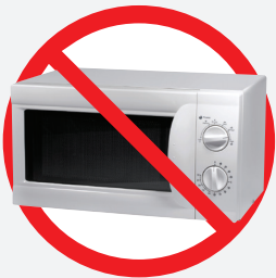
No appliances or electronics/eWaste

It is ILLEGAL to dispose of hazardous materials in your garbage or recycling containers.