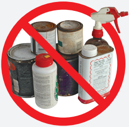
No chemical cleaners, paints, solvents or other toxic chemicals