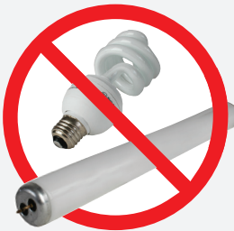
No fluorescent tubes or CFL light bulbs

Containers found to have these materials will not be collected until such materials are removed.