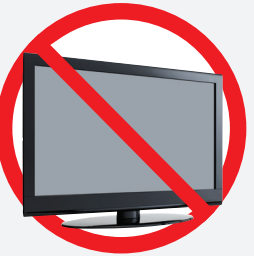
No computers, monitors or TVs