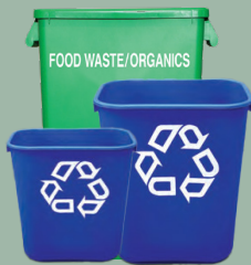
Available in various sizes and shapes.