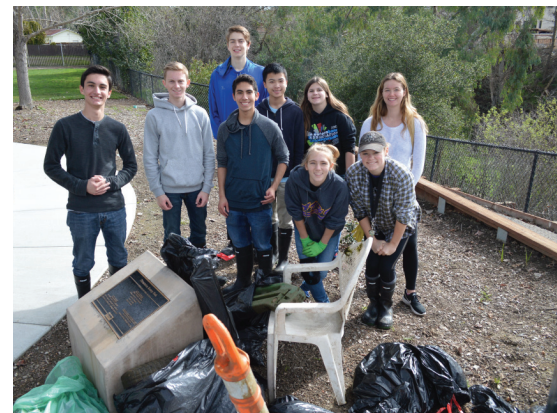
Creek Clean Up Day