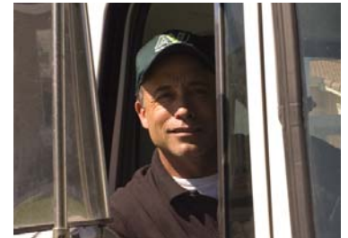
Please be sure to have your carts at the curb by 5:30 a.m.

Amador Valley Industries can pick up your non-recyclable holiday tree. Please call (925) 479-9545 to arrange for disposal of your flocked or tinsel tree at an additional disposal fee.