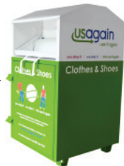
Textile recycling services provided by USAGain.

Look for Textile containers to put your cloth and leather goods in to further divert more items away from the trash... Not only are these items recycled for a further use it dramatically reduces the percentage of waste that goes into our landfills.